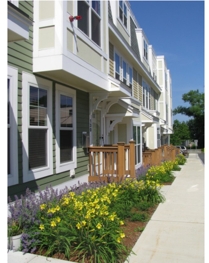
Box Works Homes

In Chelsea, the non-profit Chelsea Neighborhood Developers (CND) wanted to convert two buildings in a vacant mill complex into housing. They partnered with private developer Mitchell properties and approached the city with their proposal. This initial idea resulted in an application for a 40R district that would support a much larger project. The district will eventually include three complexes: Janus Highlands, Box Work Homes, and Atlas Lofts. Janus was completed in February of 2008 and includes 41 units in four 2-3 story buildings. This development was constructed on a vacant lot and the sites of two former industrial buildings. Box Work Homes was completed in March 2008 and includes 26 mixed-income units. The third complex, Atlas Lofts, is expected to be a mixed-income rental development and has not yet been completed.