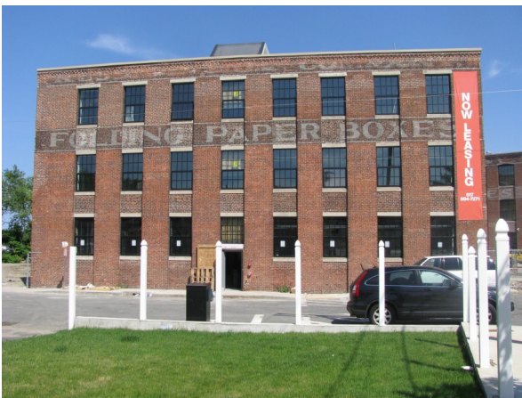
Atlas Lofts—Old Industrial Building

In order for the new developments to progress, most of the old industrial buildings had to be demolished as they did not meet current industrial standards. Atlas Lofts however is incorporating adaptive