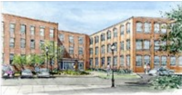
Rendering of the completed Atlas Lofts

The 40R process not only promoted affordable housing in the area, but also paid out bonus payments that the town used to make necessary infrastructure improvements in the area. These included water, drainage, and street improvements. The project also attained funding for housing through the city's Department of Housing and Community Development. They received a Commonwealth Capital Grant for the Janus development and for additional streetscape improvements. They were also the first to receive funding from the state Transit Oriented Development Program, obtaining a $500,000 grant for a pedestrian walkway, and $2 million for rental developments.