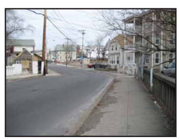
Spruce Street Bend from Daisy Street (1K)