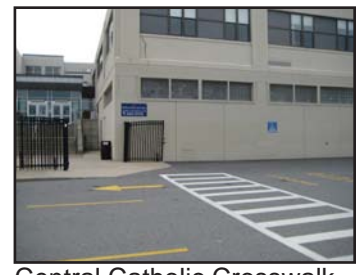
Central Catholic Crosswalk (3C)