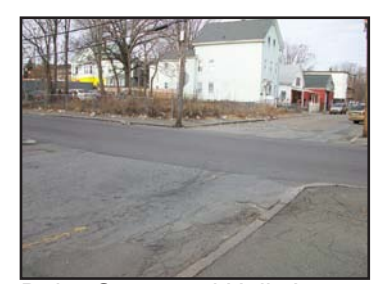
Daisy Street and Holly Intersection (2G)