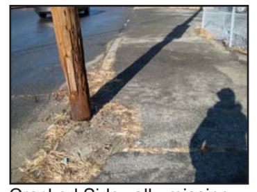
Cracked Sidewalk, missing curb on Allen Street (9C)