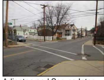
Arlington and Spruce Intersection (1B)