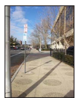
Sidewalk outside Lawrence Public Library (6B)