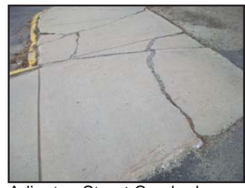
Arlington Street Cracked Sidewalk (1G)