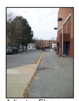
Arlington Elementary from Alder Street (1E)