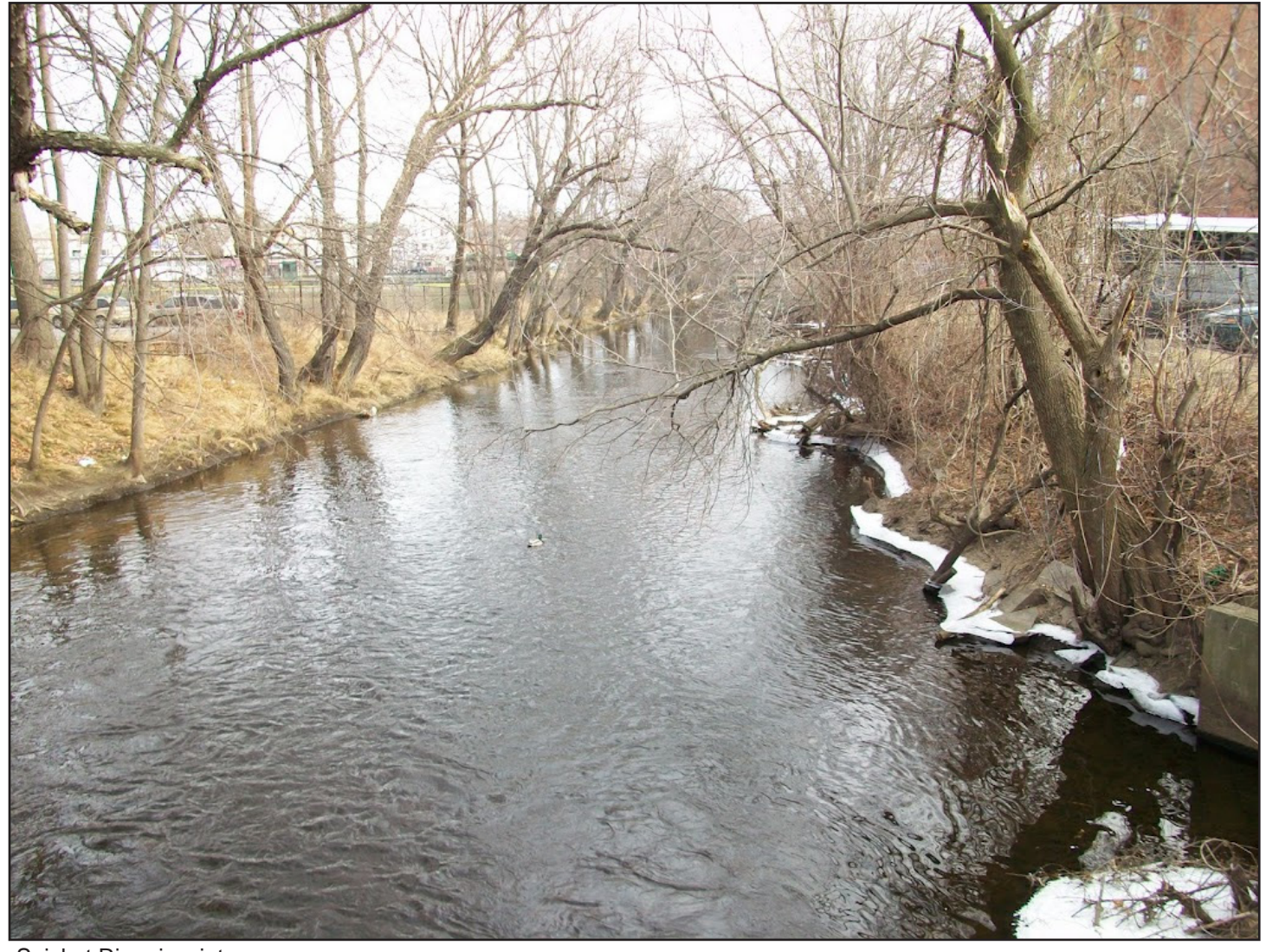
Spicket River in winter