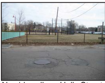
No sidewalk on Holly Street (3F)