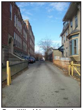
Cardillo Way: the alley way linking to Short Street and the Commons via Haverhill Street (8C)

The sidewalks on Allen Street are in complete disrepair, with uneven and cracked surfaces and some areas lacking curbs (9C, 9D, 9E). Where Al-