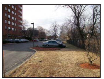
Mary Immaculate Greenway Border (4A)

The best route to the Greenway from Mary Immaculate is via Lawrence Street. The property abuts the south side of the Greenway, but the fencing and restricted access seem appropriate for the senior services center (4A). Heading north on Lawrence Street leads directly to the Greenway. The western side of Mary Immaculate also opens onto Bennington Street, and the Greenway