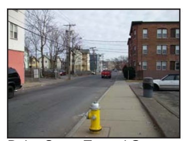
Daisy Street Toward Greenway (2F)