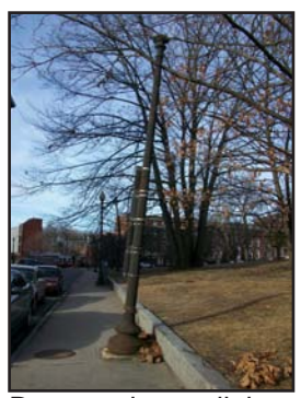
Damaged streetlight (8F)