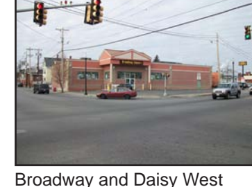
Broadway and Daisy West Corner (2B)