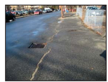
Leveled curb along Allen St (9E)

1.) Once the Greenway approaches the Oxford Paper Mill Park area, create a defined path through the parking lot and/or signage for the back entrance to the Oxford Park area.