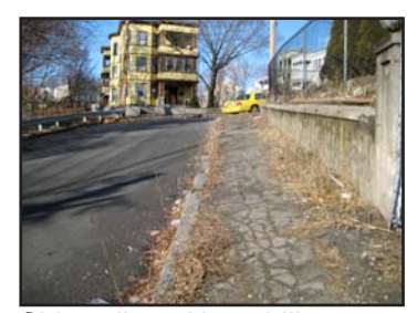
Sidewalk on Haverhill near Health Clinic (11C)