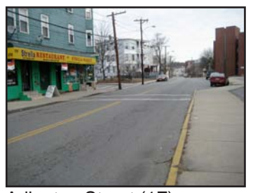
Arlington Street (1F)