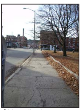
Sidewalk along eastside of Campagnone Commons (8D)