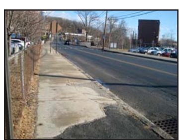
General Street sidewalk (and Greenway) leading to LGH (10B)