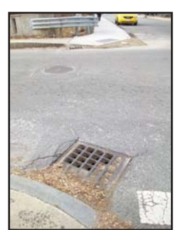
Erving and Bennington Intersection (4D)