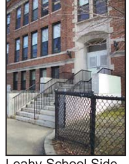
Leahy School Side Entrance (5B)