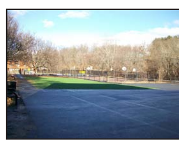
Park next to Leonard School (9F)