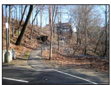
Pedestrian walkway linking LGH with Haverhill Health Clinic (11D)