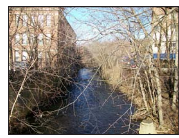
Spicket along General Street with Leonard Elementary on left side of photo (10F)