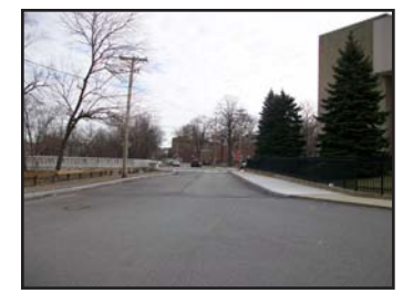
Central Catholic toward Hampshire Street (3D)