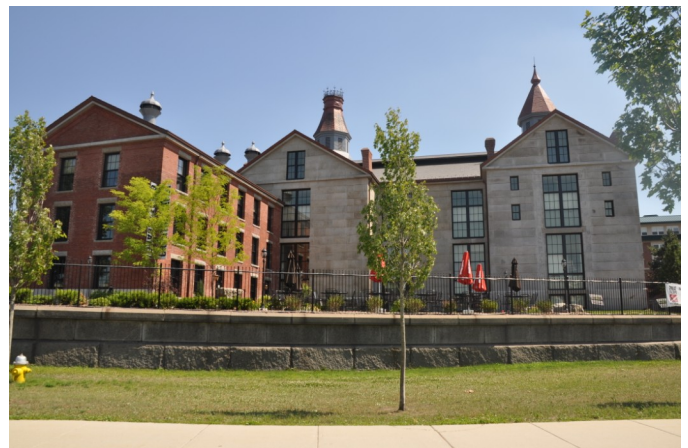
The Residences at 50 St. Peter (right) and the Great Escapes Restaurant (left), 2011.

In order for the SRA to move forward with the redevelopment of the old jail house, the city needed to re-zone the