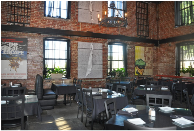
Inside the jailed themed restaurant, Great Escapes, attached to the housing complex.

boundaries of their plan for the Heritage Plaza East Urban Renewal Area to include the jail site. The new site was zoned B-5, the central zoning district which was the densest and most flexible type of zoning in the city. There was little contention from the city residents in regards to the development plan mainly because the existing site was seemed unsafe, with strangers illegally trespassing during the night. Furthermore, the public demand for public access and historical preservation were answered by developers.