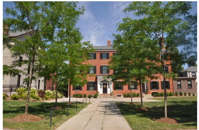
View of the restored McIntire Keeper’s House, 2011.

Even with the economic downtown, the City of Salem has continued to invest in supporting developments that improve the quality of life for its residents. This development and its success are a testament to the strong market niche in Salem and the city’s vision of creating diverse residential options for its residents.