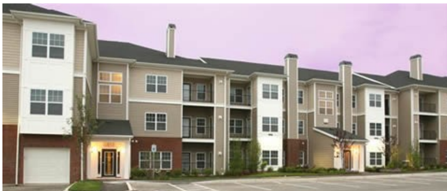
The Edgewood Apartment housing units, 2011.

After purchasing the property from the state, Burlington based developer, Gutierrez and Co., played with different concepts for development, including mainly on office and commercial space. However, when Town officials got word of the Massachusetts Chapter 40R Smart Growth Zoning act in 2005, North Reading seized the opportunity to gain financial incentives from the state in order to implement their first 40R development at the hospital site. In opting for a residential development, the Town of North Reading would be able to promote their first 40R residential development, and occur over $1.3 million in property taxes, and achieve a density bonus through the state. Furthermore the affordable housing units included within this development and as a part of this district designation would help to increase the overall affordable housing stock in North Reading to 11.1%. The end product was a large scale apartment complex with 406 units of single family housing, with about 25% of the units affordable to those who are at or