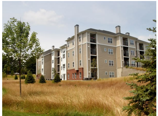
Edgewood and preserved surrounding landscape , 2011.

Located in North Reading, Edgewood Luxury Apartments was formerly home to the J.T. Berry Rehabilitation Center, a sanatorium hospital for tuberculosis patients that operated in the 1800s. The state-owned site has since been abandoned, kept under strict surveillance, and closed off from public use. The 44.6 acre site is unique not only because of its previous use but also because it is situated next to preserved wetlands and a recently discovered Native American archaeological site. In the redevelopment of the site, these unique features provided an environmental challenge. For almost 15 years, state and local officials had been working to find the best reuse for the building. Following the 1998 state legislation that encouraged former state hospital sale and reuse, the State created a re-use committee for Berry Center with town and citizen representatives, to seek various options for redevelopment.