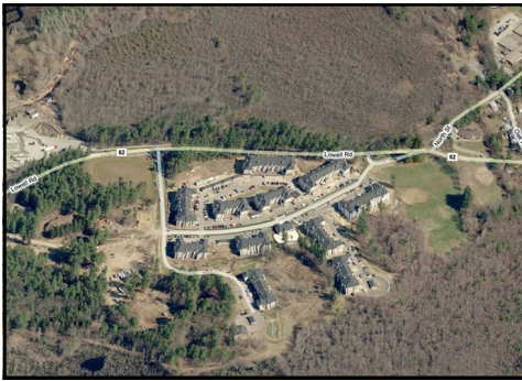
Before and after aerial view of Edgewood site, 2011.

wood become the fastest development to be approved in the town. Before the application for the 40R district, the state had rezoned the area light industrial park to promote commercial development. However developers worked strategically with the town in their desire for a mix of both residential and commercial development through the Chapter 40R application. Because the town planning board only had a couple of months left to file for this 40R designation through the Massachusetts Department of Housing and Community Development, the permitting process needed to be done as quickly and cohesively as possible. Developers were extremely upfront and worked very quickly with town planners in drafting the development, and the whole process took less than 6 months before being sent for approval. The project was non-controversial not only because of the openness of the discussion and development processes, but mainly because the location of the development was at the edge of town, away from residential abutters. Consequently, the town of North Reading became the second in the Commonwealth to apply for Chapter 40R, right after the first, town of Plymouth.