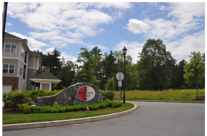
Edgewood is surrounded by natural wetlands that have preserved as part of this development, 2011.